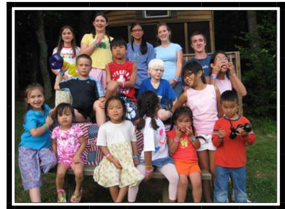
Jinan kids and some of their American siblings